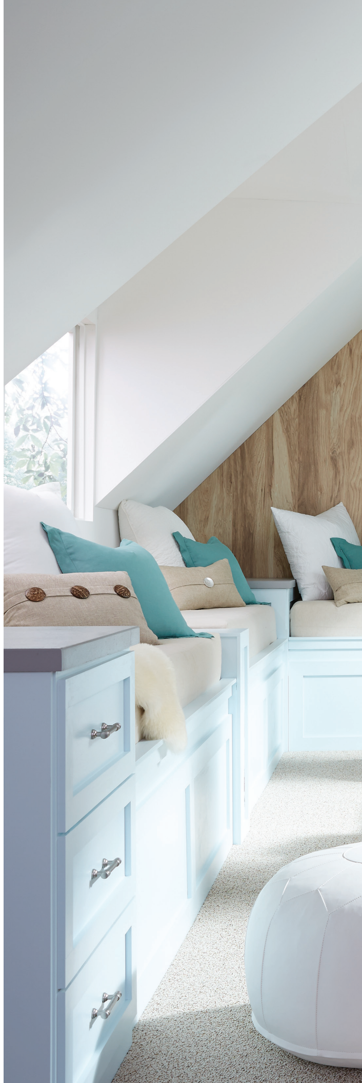
Shiny Cappuccino FS33